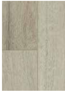
520 Light Taupe