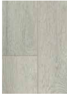
100 Whisper White