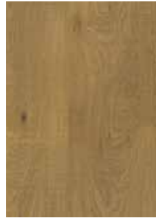
300 Nuttall Oak