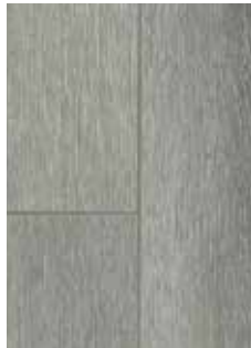
730 Timeless Grey

While all care is taken, product images may vary in colour due to possible printing process variations. Images do not seek to duplicate the exact visual appearance, but serve merely as a guide or point of reference. Actual samples should be inspected at your nearest retailer to confirm texture and colour before making a purchase decision.