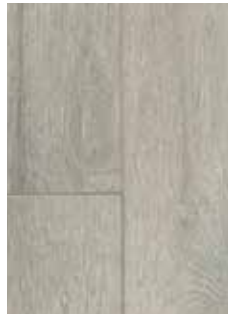
710 Ash Grey