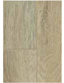
510 Tuscan Limestone