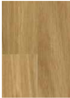
545 Eastern Blackbutt