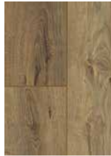
550 Tawny Brown