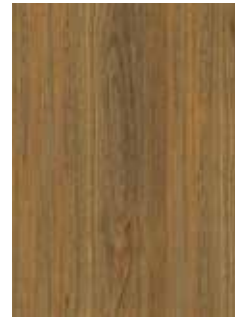
555 Spotted Gum